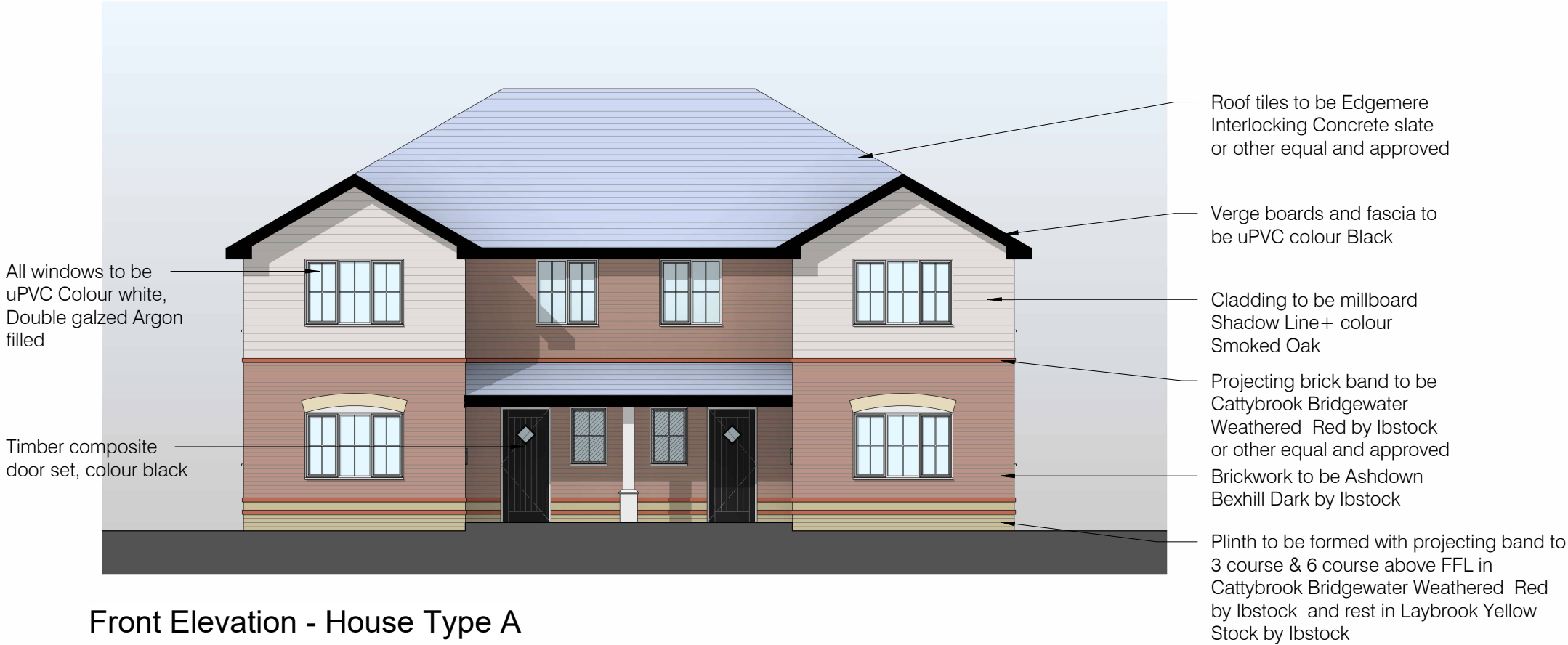
Front Elevation - House Type A